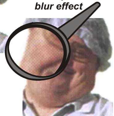
roset pattern with blur effect

BITMAPS - Best used for photos. File types .jpg, .tiff